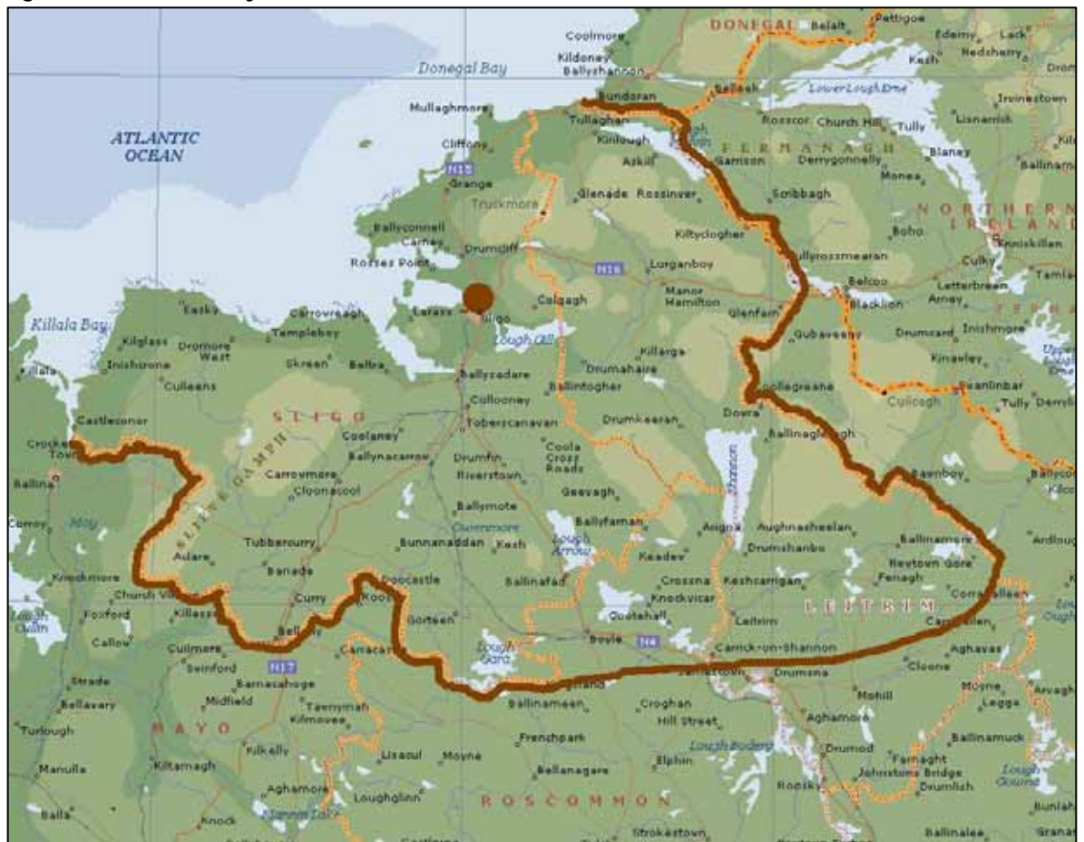
Map from Microsoft Encarta Atlas