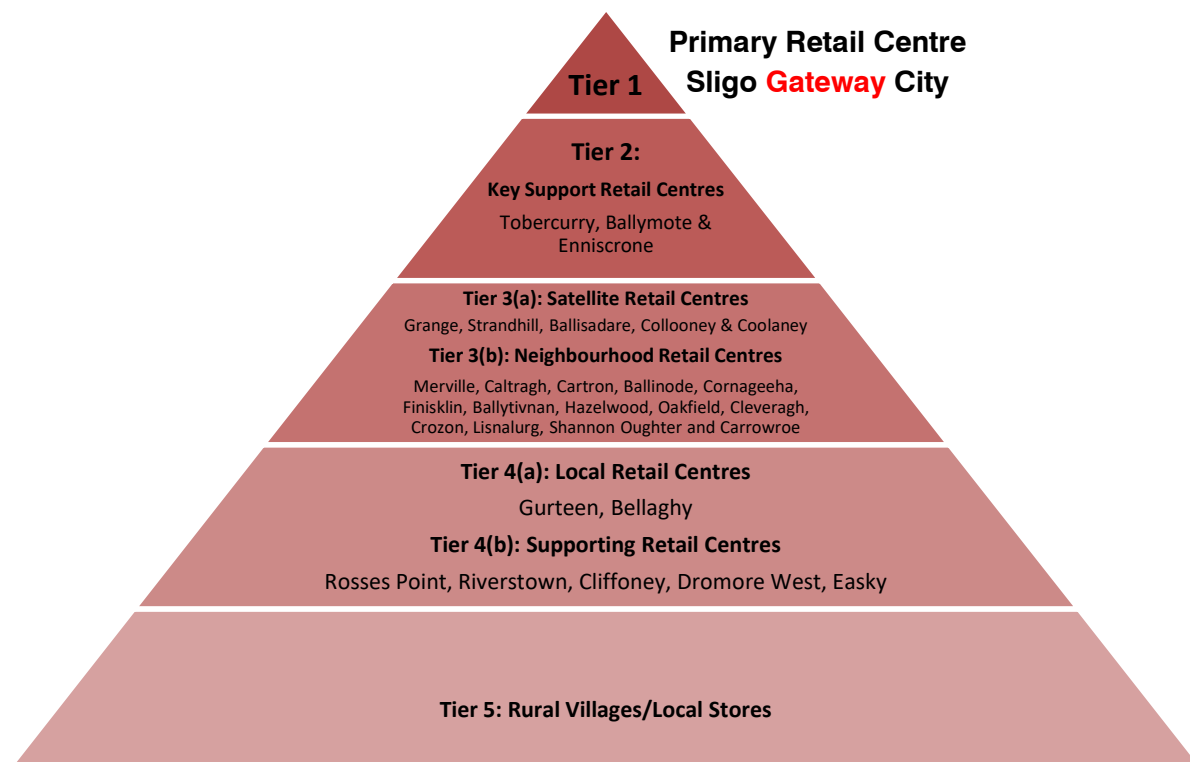
Fig. 4.E Retail hierarchy in County Sligo

The recommended retail hierarchy (see Fig. 4.E below) is largely aligned with the settlement hierarchy defined the Core Strategy of this Plan. It should be noted that there are no District Centres (as defined in the Retail Planning Guidelines ) in County Sligo.