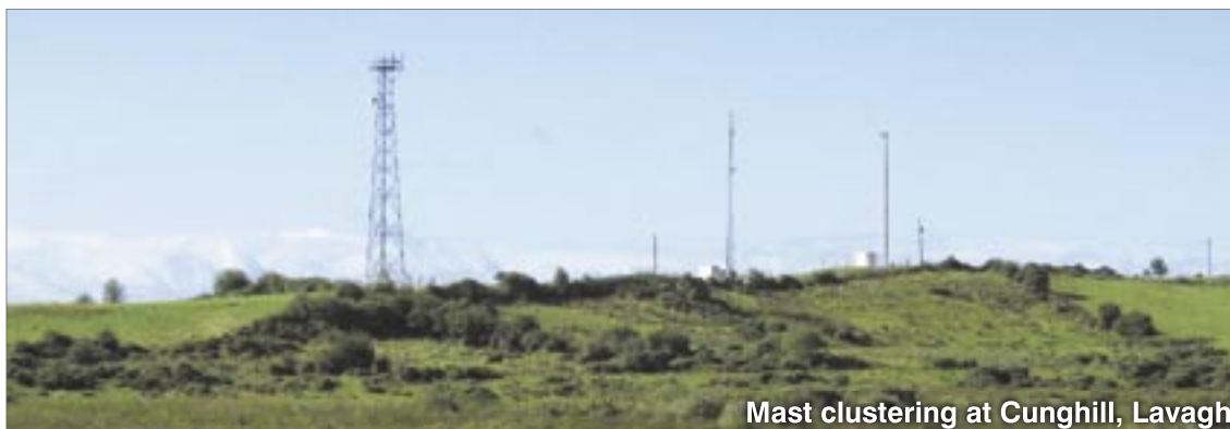
Mast clustering at Cunghill, Lavagh

In unforested areas, softening of the visual impact should be achieved through judicious choice of colour scheme and through the planting of shrubs, trees etc. as a screen and backdrop.