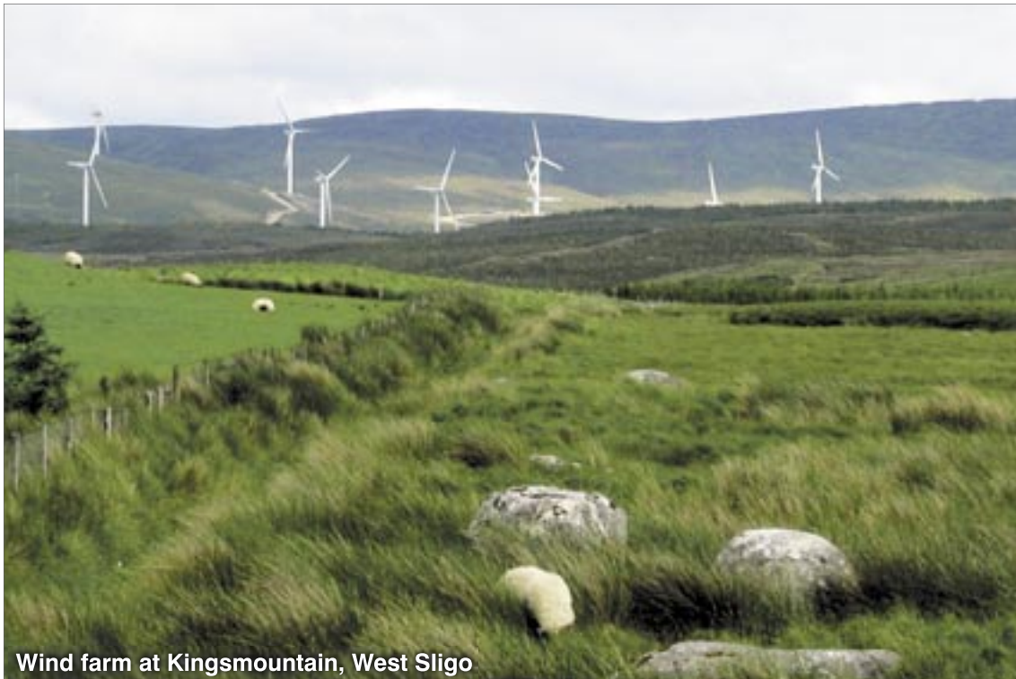
Wind farm at Kingsmountain, West Sligo