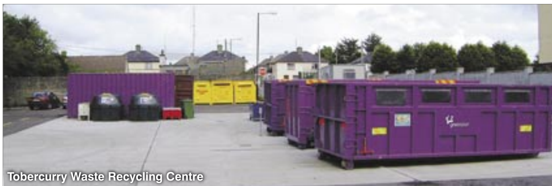
Tobercurry Waste Recycling Centre