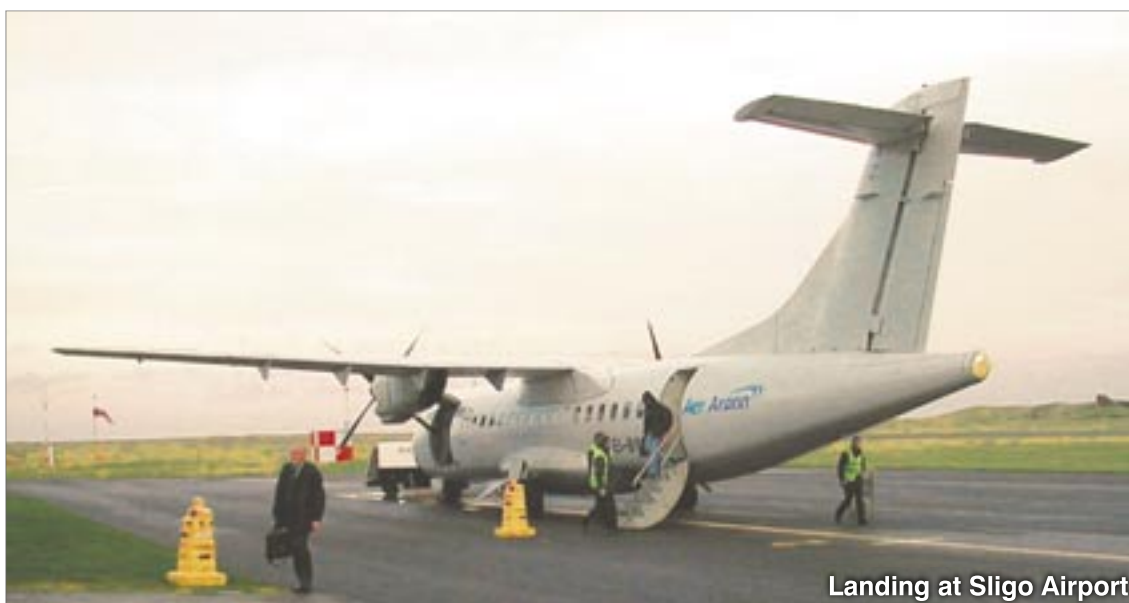
Landing at Sligo Airport