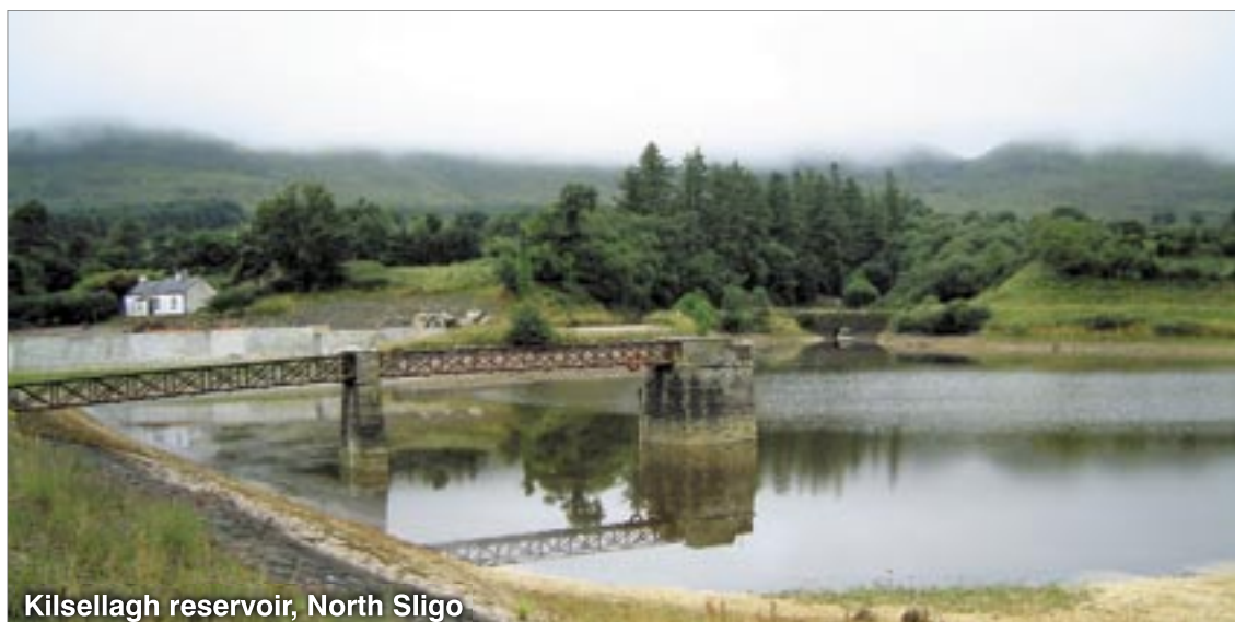
Kilsellagh reservoir, North Sligo

In general, water supply facilities and drinking water quality throughout the county need to be improved to serve existing communities and accommodate planned growth. The proposed improvements to enhance Sligo's Water Supply Schemes are outlined in Table 8.C.