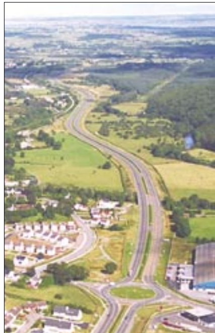
N4 from Collooney to Sligo

The NSS highlights the importance of the N17 (Sligo to Galway) and N15 (Sligo to Letterkenny) routes for the promotion of regional development. Although the National Routes comprise only 7% of the County's total road network, they carry the majority of its traffic.