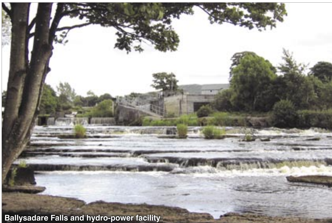
Ballysadare Falls and hydro-power facility