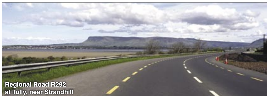
Regional Road R292 at Tully, near Strandhill