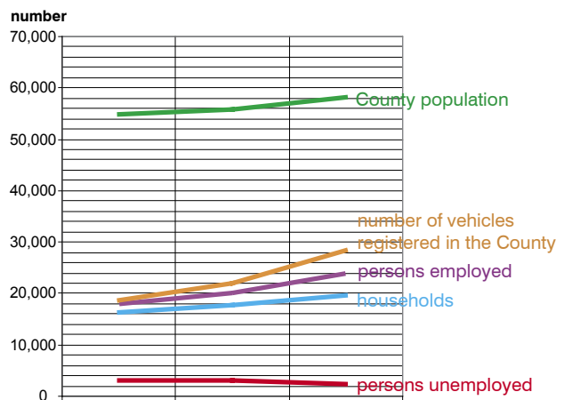
Fig. 8.a Factors influencing traffic growth in County Sligo

Many individuals have benefited from lifestyles built around the use of the car and car ownership is essential to many of those living in rural areas of the County. However, the aggregate effects of continually increasing traffic volumes can lead to serious economic, environmental and social problems, including traffic congestion, increased business costs and environmental pollution. Policies are therefore required to achieve a shift towards public transportation and a more efficient use of land. This chapter sets out policies for all forms of transportation. These policies are complemented by the settlement strategy (Section 3) and land use zoning objectives for selected settlements (Section 11).