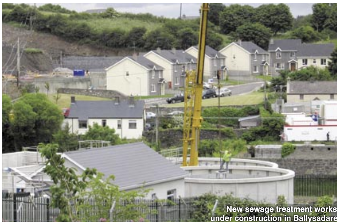
New sewage treatment works under construction in Ballysadare

A Sludge Management Plan for County Sligo has been submitted to the DoEHLG for approval. All sludge generated from public sewerage schemes throughout the County and from private treatment systems (excluding individual septic tank systems serving one-off housing) will have to be transported to a hub centre at the Sligo Main Drainage Centre at Finisklin. To facilitate the sludge collection process, it is intended to provide five satellite stations around the County at the following locations: Ballymote, Enniscrone, Tubbercurry, Collooney and Grange.