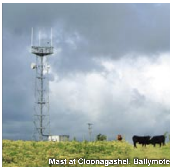
Mast at Cloonagashel, Ballymote

Intensive digitisation offers a competitive advantage in attracting economic development and investment. It also offers more flexible working arrangements, enabling people to work and communicate internationally from their homes. As outlined in Section 5.3.1 and as highlighted by the WDC ( Update on Telecommunications in the Western Region, 2002 ), the movement away from labour-intensive manufacturing industry to the skilled service sector of the economy has major policy implications for the provision of infrastructure, particularly the provision of telecommunications. Sligo County Council acknowledges the importance of the telecommunications sector and, in particular, the development of broadband telecommunications, in terms of capitalising on investment opportunities.