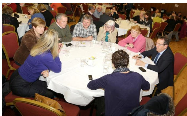
PPN Members participating in discussion groups 2014

The role of the PPN is to facilitate structured input by community and voluntary groups, social inclusion groups and environmental groups through representation on various local policy making committees such as the Local Community Development Committee, Strategic Policy Committee,