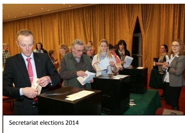
Secretariat elections 2014

In September 2013 the Government established the Working Group on Citizens Engagement in Local Government to make recommendations on more extensive and diverse input by citizens into the decision making at local government level. The Report of the Working Group, published on 28 th February 2014, recommends the establishment of a number of new structures to facilitate community engagement in local decision-making. In particular they propose the establishment of a Public Participation Network (PPN) in each local authority area to enable the public take an active formal role in relevant policy making and oversight committees of the local authority. Following the